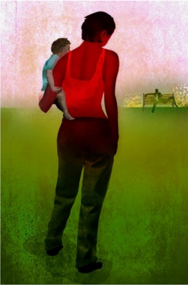
Childbearing outside wedlock is rising among 20-somethings as teen pregnancy has dropped. BRIAN STAUFFER

Indeed, 20-somethings are driving America's all-time high level of nonmarital childbearing, which is now at 41% of all births, according to vital-statistics data from the Centers for Disease Control and Prevention. Sixty percent of those births are to women in their 20s, while teens account for only one-fifth of nonmarital births. Between 1990 and 2008, the teen pregnancy rate has dropped by 42%, while the rate of nonmarital childbearing among 20-something women has risen by 27%.